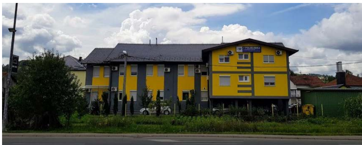
Figure 1b: Former location of the monument, 2019

This monument was the work of Drago Handanović and Petar Vajdić (Gradska galerija Bihać, 2008 p.10). It was unveiled in 1984, and was located close to the centre of the settlement of Matuzići. As described in Od ustanka do pobjede - zbornik sjećanja iz NOR-a u dobojskom kraju (pp.487-488), the monument consisted of a plateau paved with granite cobbles, upon which were situated three earthen tumuli with concrete retaining walls and a five-sided concrete obelisk vertically divided into