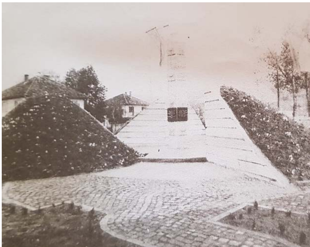
Figure 1a: Monument in the 1980s